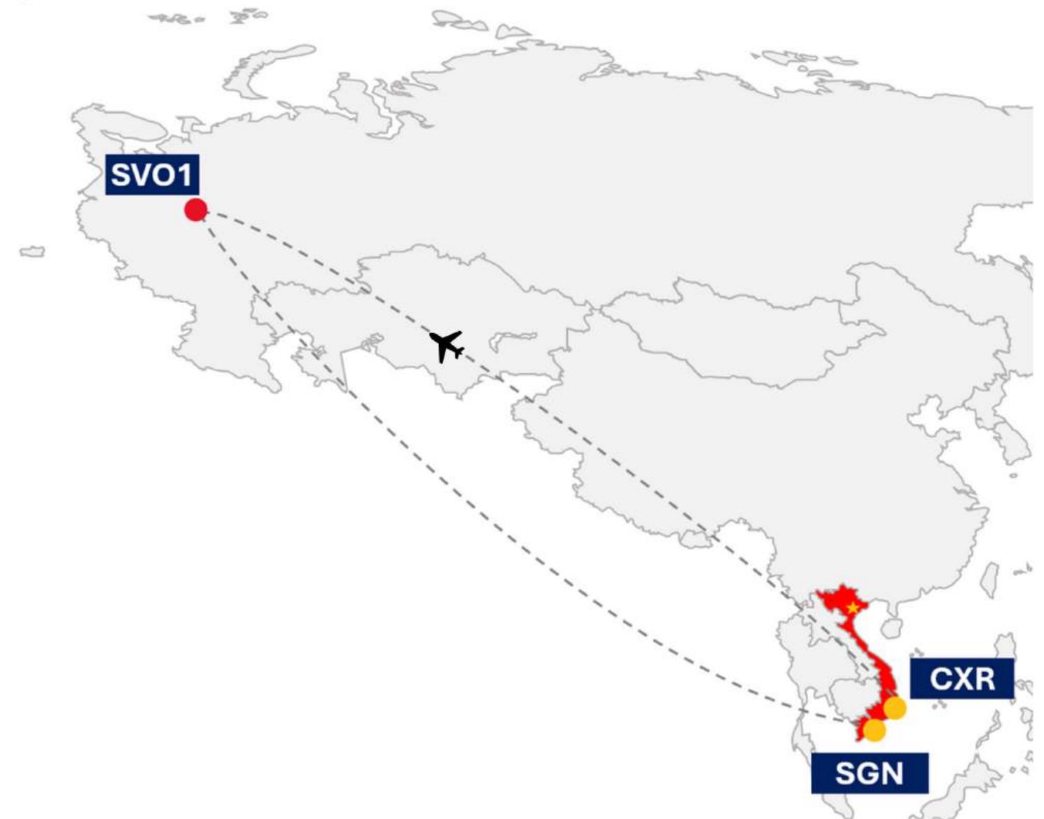
Airfreight from SGN/CXR to SVO1