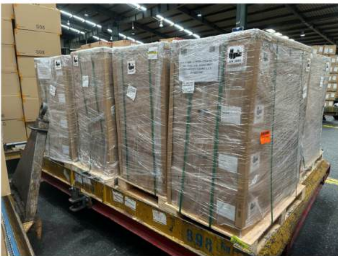
Cargo processed at the airport